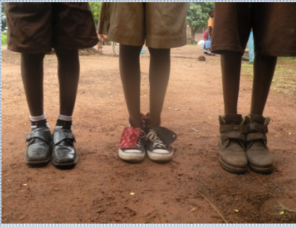
Konda students show off their school shoes.